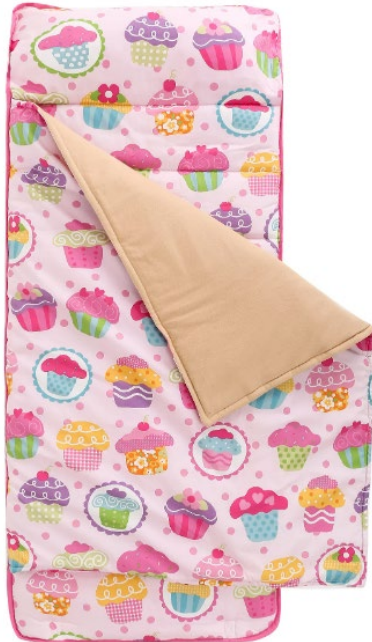
Example Nap Mat Set