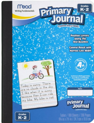
Mead Primary Journal Notebook Wide Ruled